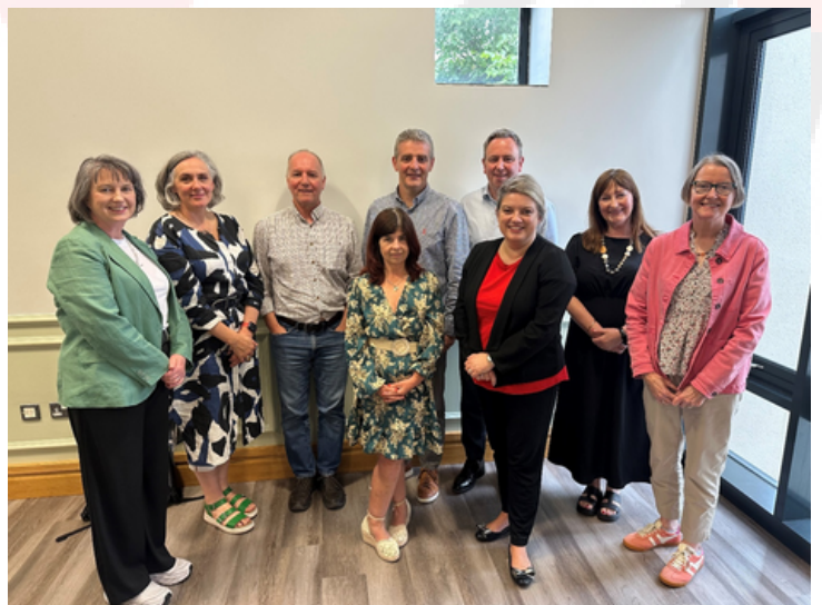
(Picture above) Members of the Strengthening Communities for Health Steering Group

visit: Expansion of community development approaches | HSC Public Health Agency