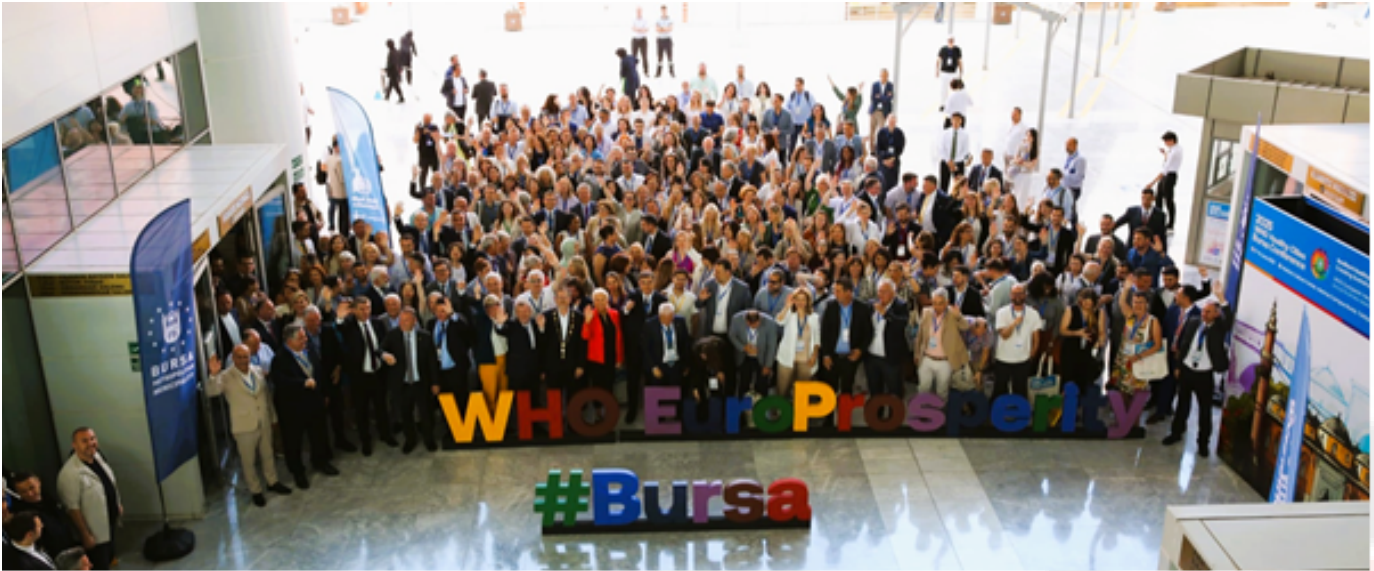
WHO Healthy Cities Network Annual Business Meeting, Bursa, Türkiye

UK Member cities benefit from access to WHO expertise, networking opportunities, and support in developing innovative approaches to urban health. Belfast is joined on the UK Network Steering Group by cities including Liverpool, which brings valuable insight and leadership to the collaborative effort.